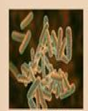
Adhered bacterial pathogen