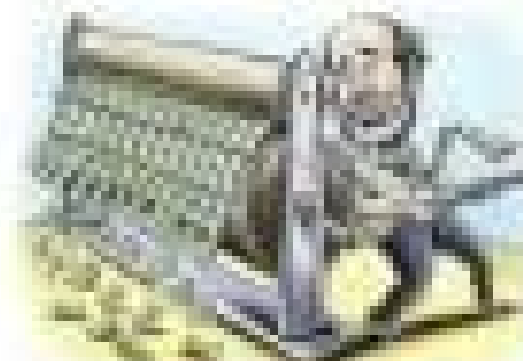
Applying Theory C