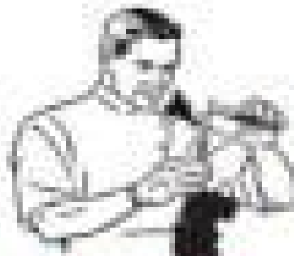
Applying Theory B