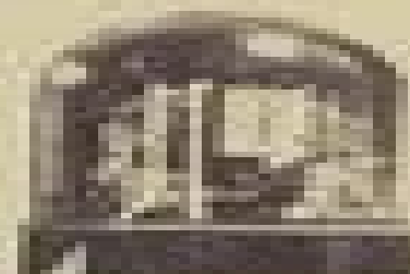
Managing your growth problems and uncertainties