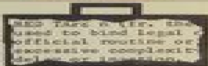
Managing your growth problems and uncertainties