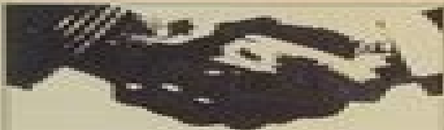
Managing your growth problems and uncertainties

How to solve the problems of growing companies