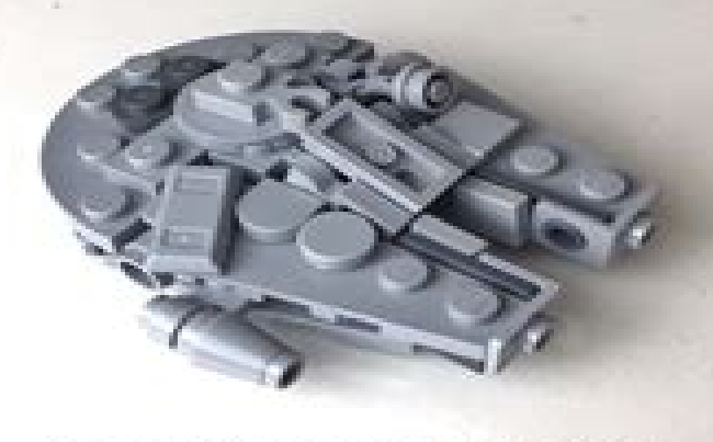
MICRO MILLENIUM FALCON DIDATHEBRICKS