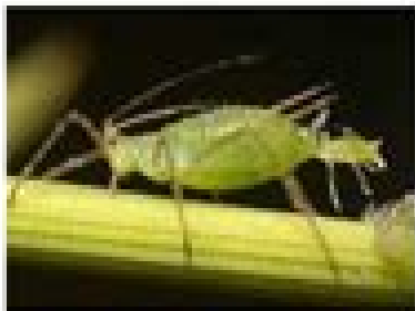
Aphids and Ants