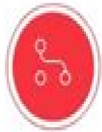
Strategic B2B Partners