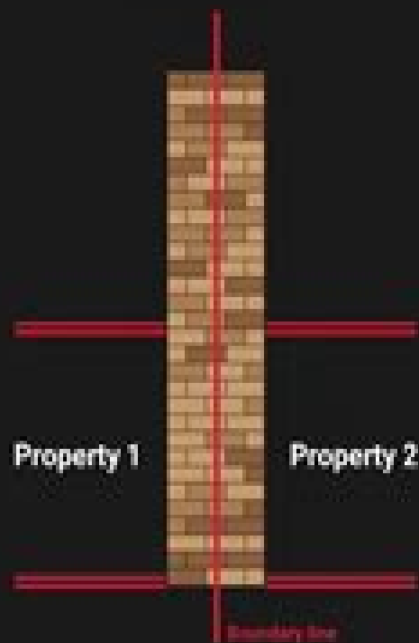
Party wall type A