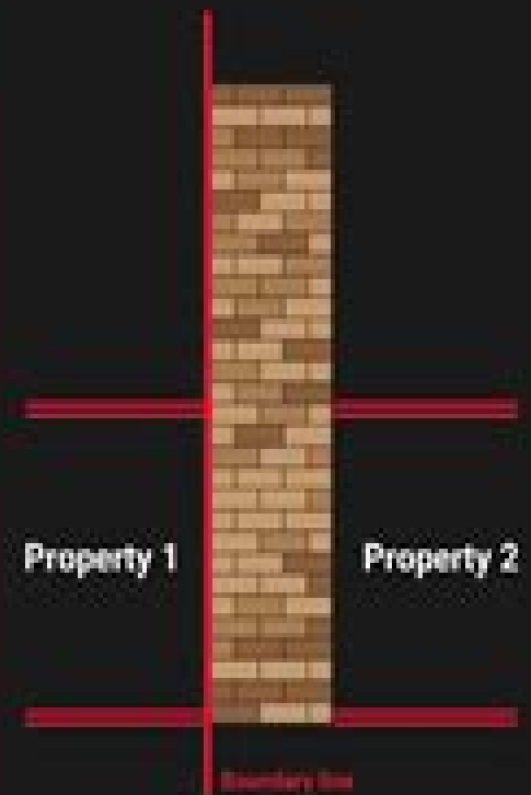
Party wall type C