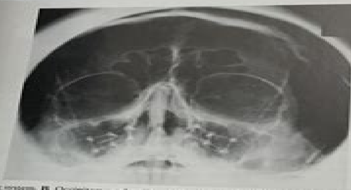
Table 16.2 The Leubinger 3-D plating system. B. Occipitomental radiograph showing the use of the 3-dimensional plating system in the fixation of a maxillary fracture.