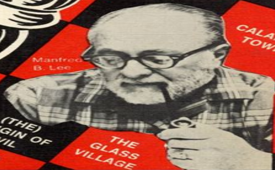
Manfred B. Lee