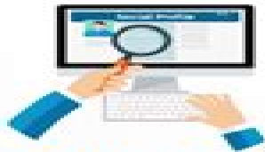
SOCIAL MEDIA MANAGER

Looking to start a small business on the side? Get started with these 10 simple ideas in your spare time. They come with low overhead costs, helping to mitigate