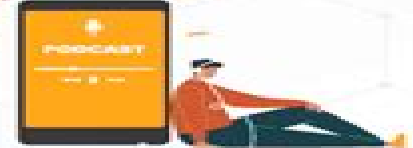
PODCASTS AND BLOGS