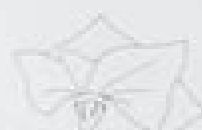
13. NAPKIN NOCTURNE