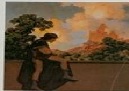
The Knife-Watching Lady Violetta Depart, 1924