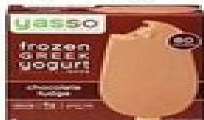
A Frozen Yogurt Bar