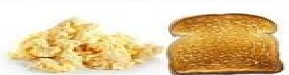
2 Egg Whites & A Toast