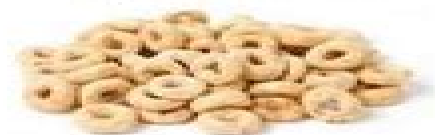
1 Cup Cheerios