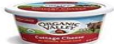
1/2 Cup Cottage Cheese