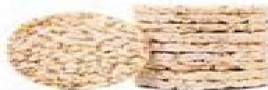
2 Flavored Rice Cakes