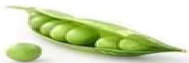
1 Cup Sugar Snap Peas

Journal of the American Heart Association