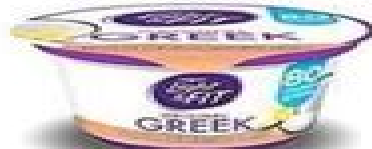
Nonfat Greek Yogurt