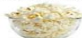
3 Cups Air-Popped Popcorn