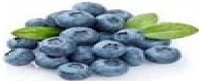
1 Cup Blueberries