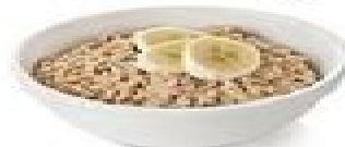
1/2 Cup Oat