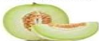
1 Cup Melon