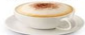
Small Latte w/ Skim Milk