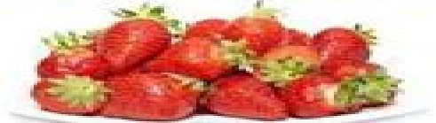
1 Cup Strawberries