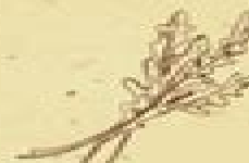
ROCKET / ARUGULA