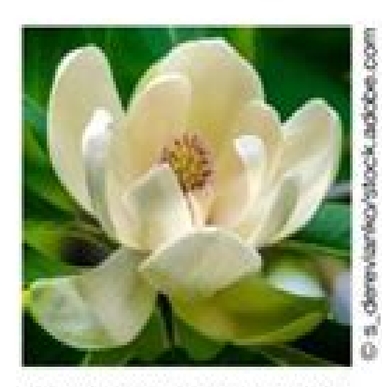
flower: southern magnolia