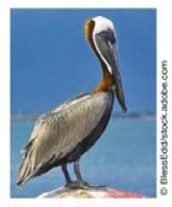
bird: eastern brown pelican