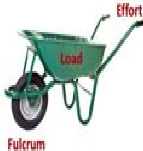
Class-II or Second Order Lever