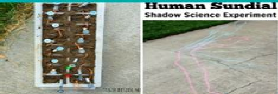
Human Sundial Shadow Science Experiment