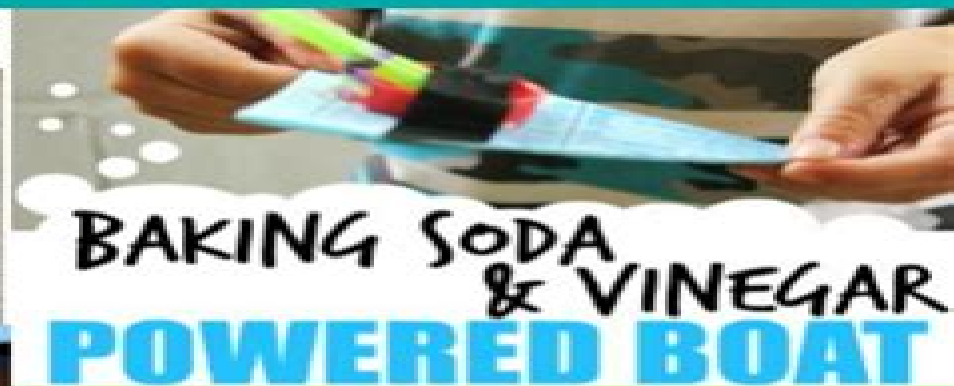
BAKING SODA & VINEGAR POWERED BOAT