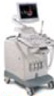
Ultra sound machine