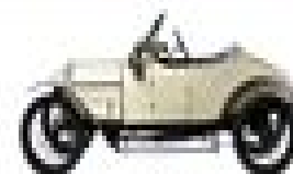
1902 Ford Model N

The 1901 Ford Model N was the first mass-produced car in the world. It was designed to be produced in large quantities and to be sold at a low price.