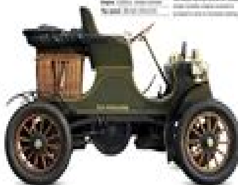
1907 Ford Model N Make: Ford Model: 1907 Model N Year: 1907 The 1907 Ford Model N was the first mass-produced car in the world. It was designed to be produced in large quantities and to be sold at a low price.

The 1906 Ford Model N was the first mass-produced car in the world. It was designed to be produced in large quantities and to be sold at a low price.