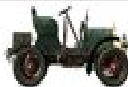
1900 Ford Model N Make: Ford Model: 1900 Model N Year: 1900 The 1900 Ford Model N was the first mass-produced car in the world. It was designed to be produced in large quantities and to be sold at a low price.

By the end of the first decade of the 20th century it had become clear that the future of the automobile lay not only in mass production, but also in standardization of the product. As the demand for mass-produced automobiles grew, manufacturers began to develop cars that could be produced in large quantities. This led to the development of the early production-line cars, which were designed to be produced in large quantities and to be sold at a low price.