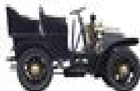
1906 Ford Model N Make: Ford Model: 1906 Model N Year: 1906 The 1906 Ford Model N was the first mass-produced car in the world. It was designed to be produced in large quantities and to be sold at a low price.

The 1905 Ford Model N was the first mass-produced car in the world. It was designed to be produced in large quantities and to be sold at a low price.