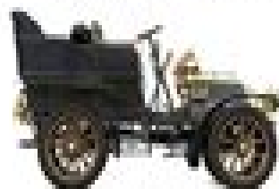
1909 Ford Model N Make: Ford Model: 1909 Model N Year: 1909 The 1909 Ford Model N was the first mass-produced car in the world. It was designed to be produced in large quantities and to be sold at a low price.

The 1908 Ford Model N was the first mass-produced car in the world. It was designed to be produced in large quantities and to be sold at a low price.