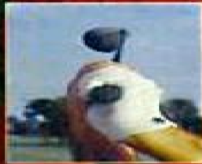
Clubface open at the top of the swing