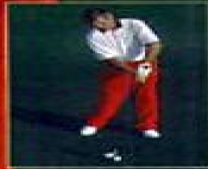
Impact with cupped left wrist and face open