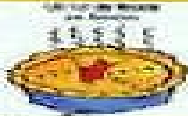
das rote die Krone die Krone