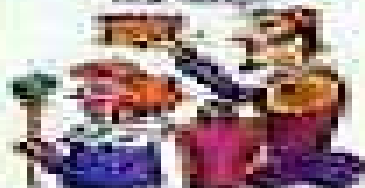
die beiden Herren die Kaiser-Minister