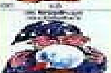
das Kuchlein die Hochzeit