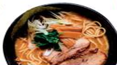
ラーメン rāmen wheat noodles in meat broth