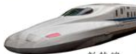
新幹線 shin kan sen bullet train