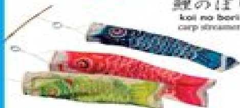
鯉のぼり koi no bori carp streamer