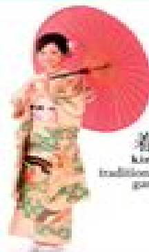
着物 kimono traditional Japanese garment