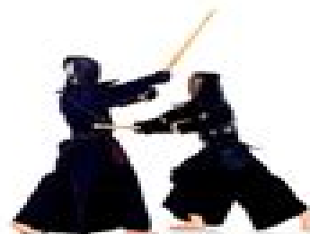
剣道 ken dō Japanese fencing