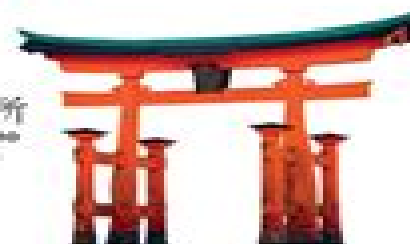
観光の名所 kankō no meisho tourist attraction