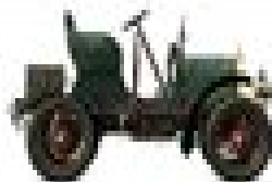
1900 Ford Model N Year: 1900 Make: Ford Model: Model N The Ford Model N was a four-cylinder car with a top speed of 25 mph. It was the first Ford car to be produced in large quantities.

By the end of the first decade of the 20th century it had become clear that the future of the automobile lay not only in mass production, but also in standardization of parts and components. As the demand for more and more reliable cars grew, manufacturers began to develop a system of interchangeable parts that would allow them to produce cars in large quantities. This was the beginning of the modern production line, and it was this system that made the automobile a truly mass-produced vehicle.