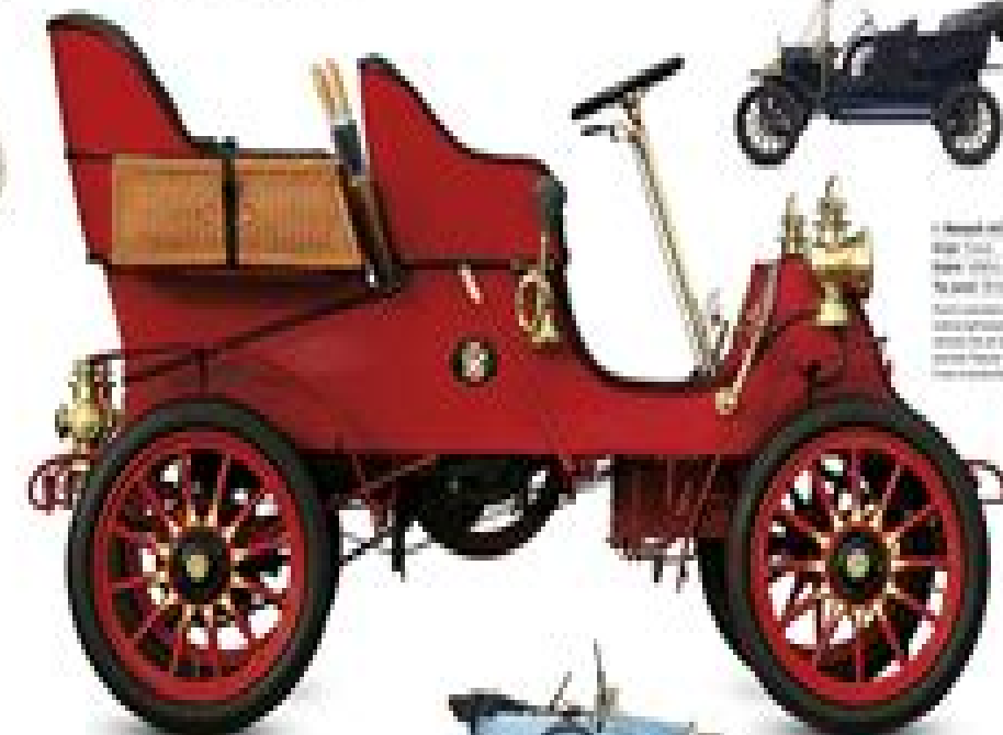
1900 Buick Model 1990 Year: 1900 Make: Buick Model: Model 1990 The Buick Model 1990 was a four-cylinder car with a top speed of 25 mph. It was the first Buick car to be produced in large quantities.