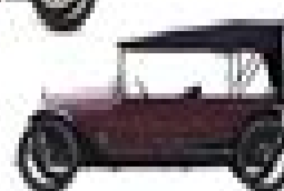
1900 Ford Model N Year: 1900 Make: Ford Model: Model N The Ford Model N was a four-cylinder car with a top speed of 25 mph. It was the first Ford car to be produced in large quantities.