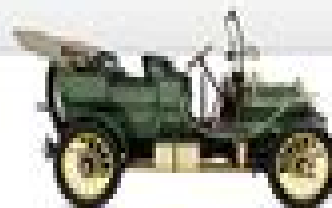
1900 Buick Model 1990 Year: 1900 Make: Buick Model: Model 1990 The Buick Model 1990 was a four-cylinder car with a top speed of 25 mph. It was the first Buick car to be produced in large quantities.

The Buick Model 1990 was a four-cylinder car with a top speed of 25 mph. It was the first Buick car to be produced in large quantities.