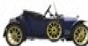
1900 Buick Model 1990 Year: 1900 Make: Buick Model: Model 1990 The Buick Model 1990 was a four-cylinder car with a top speed of 25 mph. It was the first Buick car to be produced in large quantities.