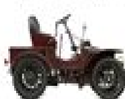
1900 Packard Model 1990 Year: 1900 Make: Packard Model: Model 1990 The Packard Model 1990 was a four-cylinder car with a top speed of 25 mph. It was the first Packard car to be produced in large quantities.