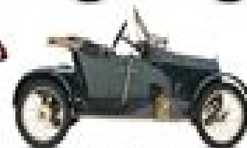
1900 Ford Model N Year: 1900 Make: Ford Model: Model N The Ford Model N was a four-cylinder car with a top speed of 25 mph. It was the first Ford car to be produced in large quantities.