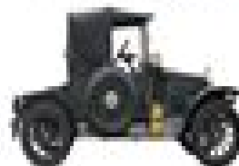
1900 Buick Model 1990 Year: 1900 Make: Buick Model: Model 1990 The Buick Model 1990 was a four-cylinder car with a top speed of 25 mph. It was the first Buick car to be produced in large quantities.