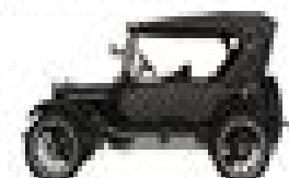
1900 Buick Model 1990 Year: 1900 Make: Buick Model: Model 1990 The Buick Model 1990 was a four-cylinder car with a top speed of 25 mph. It was the first Buick car to be produced in large quantities.