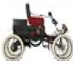
1900 Studebaker Model 1990 Year: 1900 Make: Studebaker Model: Model 1990 The Studebaker Model 1990 was a four-cylinder car with a top speed of 25 mph. It was the first Studebaker car to be produced in large quantities.