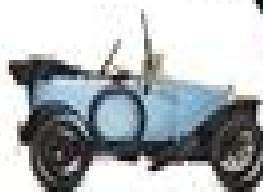
1900 Buick Model 1990 Year: 1900 Make: Buick Model: Model 1990 The Buick Model 1990 was a four-cylinder car with a top speed of 25 mph. It was the first Buick car to be produced in large quantities.