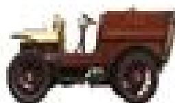
1900 Buick Model 1990 Year: 1900 Make: Buick Model: Model 1990 The Buick Model 1990 was a four-cylinder car with a top speed of 25 mph. It was the first Buick car to be produced in large quantities.