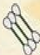
Cotton swabs (US) Cotton buds (UK)