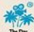
The Day of the Locust Theodor Dreiser, 1928 Philadelphia, PA