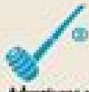
Adventures of Huckleberry Finn Mark Twain, 1852 Hannibal, MO