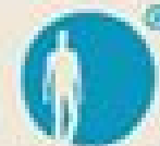
Invisible Man Ralph Ellison, 1952 Columbus, SC