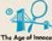
The Age of Innocence Edith Wharton, 1905 New York, NY