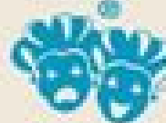
The Moonlighter Walker Percy, 1961 New Orleans, LA