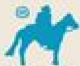
Blood Meridian Cormac McCarthy, 1985 Texas