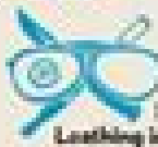
Fear and Loathing in Las Vegas Hunter S. Thompson, 1971 Las Vegas, NV