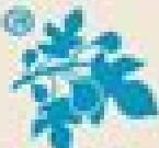
The Bell Jar Sylvia Plath, 1963 New York, NY