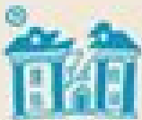
The Sound and the Fury William Faulkner, 1929 Oxford, MS