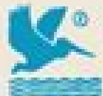
The Awakening Kate Chopin, 1899 New Orleans, LA