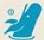
Moby Dick Herman Melville, 1851 New York, NY

Places from the pages of America's finest literary works