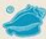
To Have and Have Not Ernest Hemingway, 1937 Key West, FL