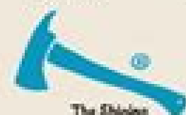
The Shining Stephen King, 1977 Eaton, CO