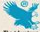
The Adventures of Augie March Saul Bellow, 1947 Chicago, IL