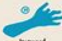
Ironweed William Kennedy, 1983 Albany, NY