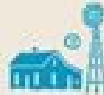
My Antonia Willa Cather, 1918 Nebraska County, NE