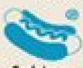
Confederacy of Dunces John Kennedy Toole, 1980 New Orleans, LA