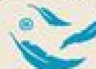
To Kill a Mockingbird Harper Lee, 1960 Monroeville, AL