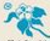
Their Eyes Were Watching God Zora Neale Hurston, 1937 Central FL Southern FL