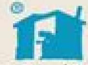
The Grapes of Wrath John Steinbeck, 1939 Salinas, CA