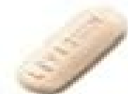
Levofloxacin 500 mg