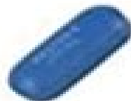
Valtrex 500 mg