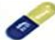
Cymbalta 60 mg